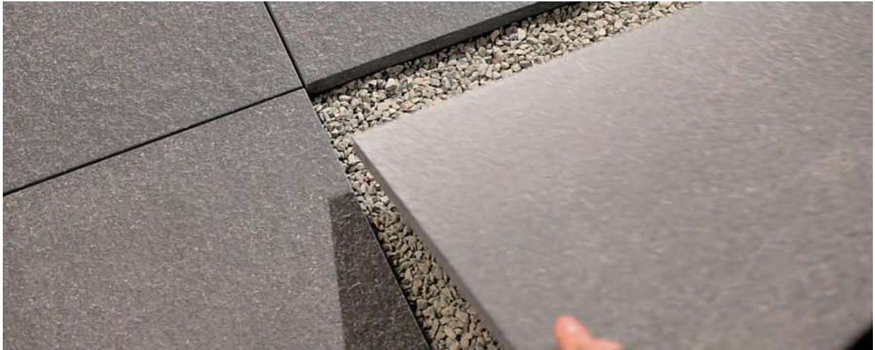
Pavers installed on screed stone