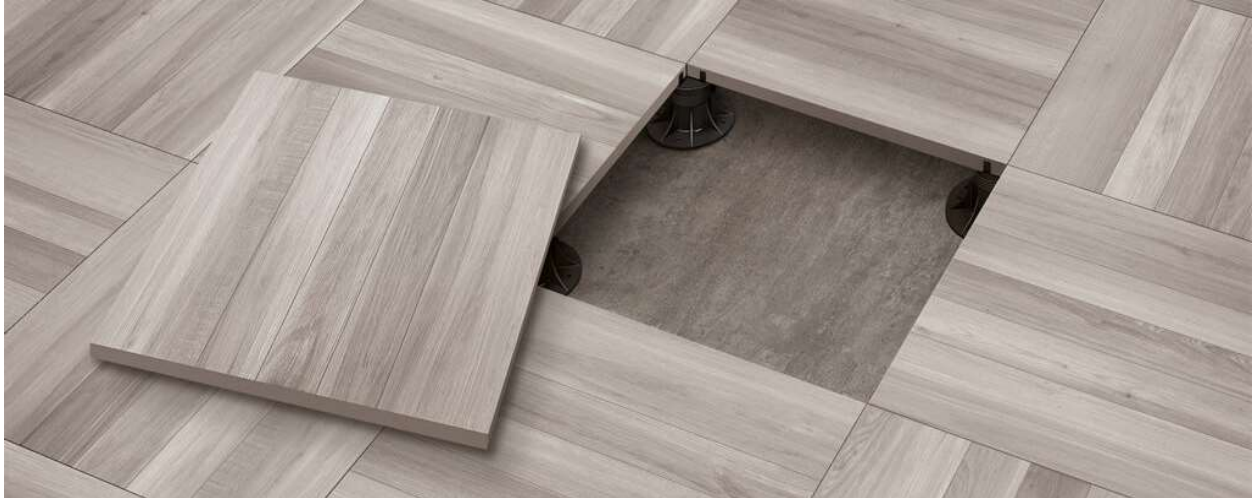
Pavers installed on pedestals over a concrete deck