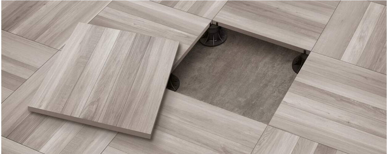
Pavers installed on pedestals over a concrete deck