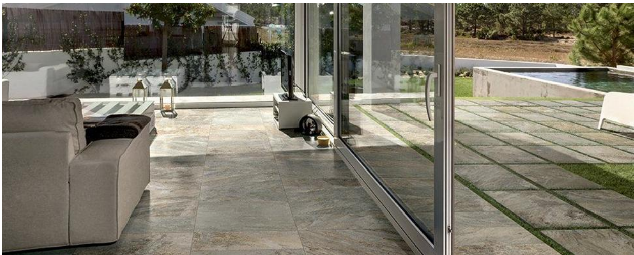
Pavers installed indoors on concrete and outdoors on grass